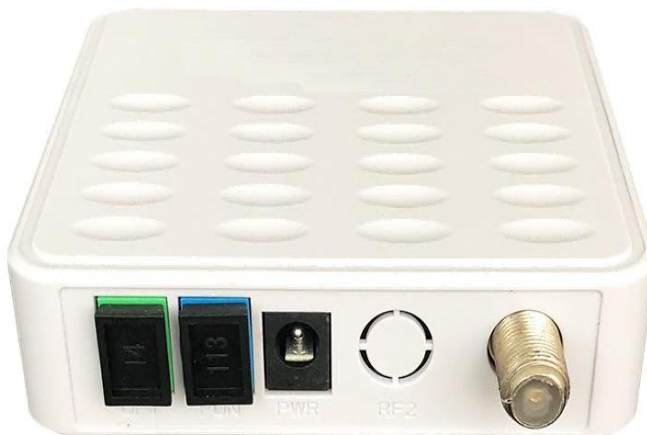
Figure 1 1 RF Output

The V8601C is a mini in-door optical receiver build in WDM, design for FTTP/FTTH transmission applications. It delivers excellent frequency and distortion responses with low noise, high RF output, and low power consumption. The V8601C package is single mode fiber-pigtailed and is available with various connector options.